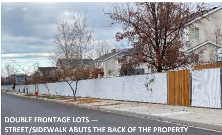
DOUBLE FRONTAGE LOTS — STREET/SIDEWALK ABUTS THE BACK OF THE PROPERTY